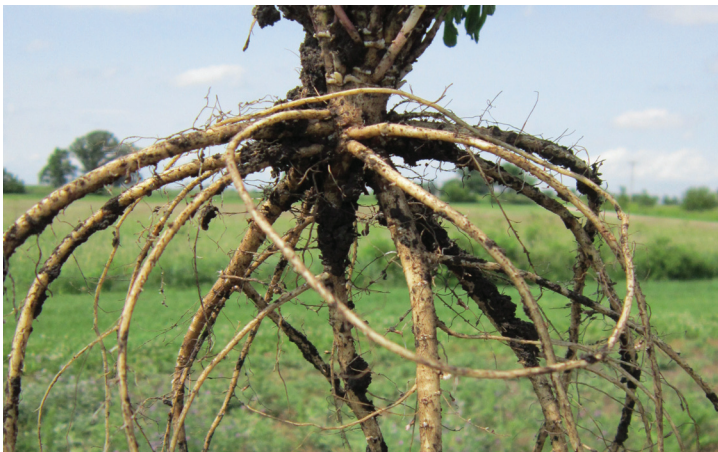
Shockwave BR has a branch rooted trait that allows it to perform better in higher water tables.