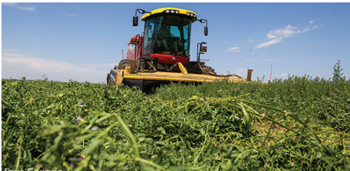
Maxi-Ton Pro™ dense persistent stands make it a forage yield leader.