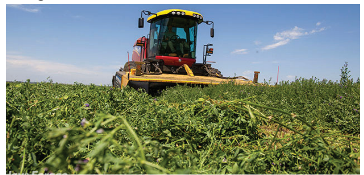
Maxi-Ton Pro<sup>™</sup> dense persistent stands make it a forage yield leader.